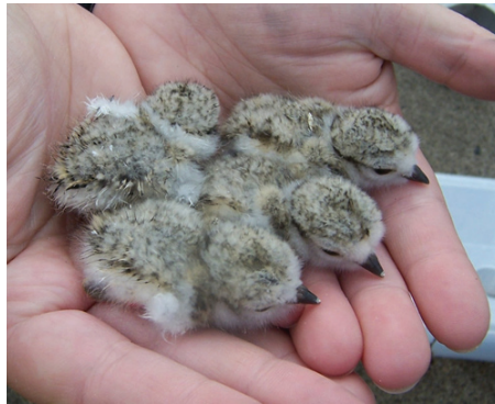
A trained biologist holds four day-old piping plover chicks from a nest on a sandbar.

The Joint Meeting of the Association of Field Ornithologists, Cooper Ornithological Society, and Wilson Ornithological Society, hosted by the Tern and Plover Partnership and others at SNR