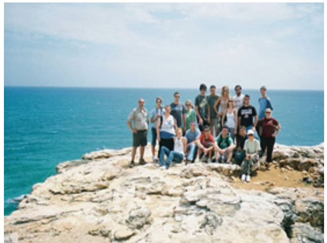
Faculty members lead a student trip over Spring Break to explore the rain forests, dry grasslands, and marine ecosystems of Puerto Rico.

Summer 2011: The Water Center's annual Water Tour will explore the Ogallala Aquifer.