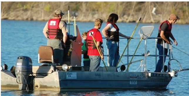
Students learn electrofishing, a research technique that temporarily stuns fish, at Branched Oak Lake.

Undergraduate Scholarships Awarded: 36, totaling $25,808