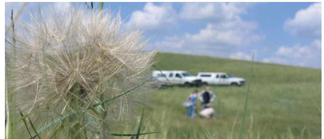
Goatsbeard grows at the Barta Brothers Ranch in western Nebraska..

The vision for the School of Natural Resources (SNR) is to be an international leader in natural resources education, research and outreach, and to be the primary provider of natural resources information and service to the citizens and stakeholders of Nebraska.