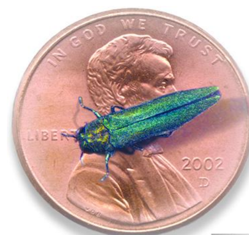
Emerald Ash Borer.

Emerald ash borer (right) is an Asian beetle, likely transported to the United States in wood packing materials. This invasive beetle has cost property owners and industry tens of millions of dollars due to ash tree damage. The emerald ash borer has not yet been found in Nebraska, but the risk is high.