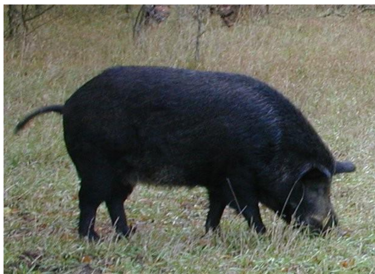
Feral Hog.

Feral hogs (left) damage property, wildlife habitat, and have the ability to spread disease. They can be extremely costly to control, and are now found in Nebraska. This introduction poses a serious threat to the environment and agricultural production.