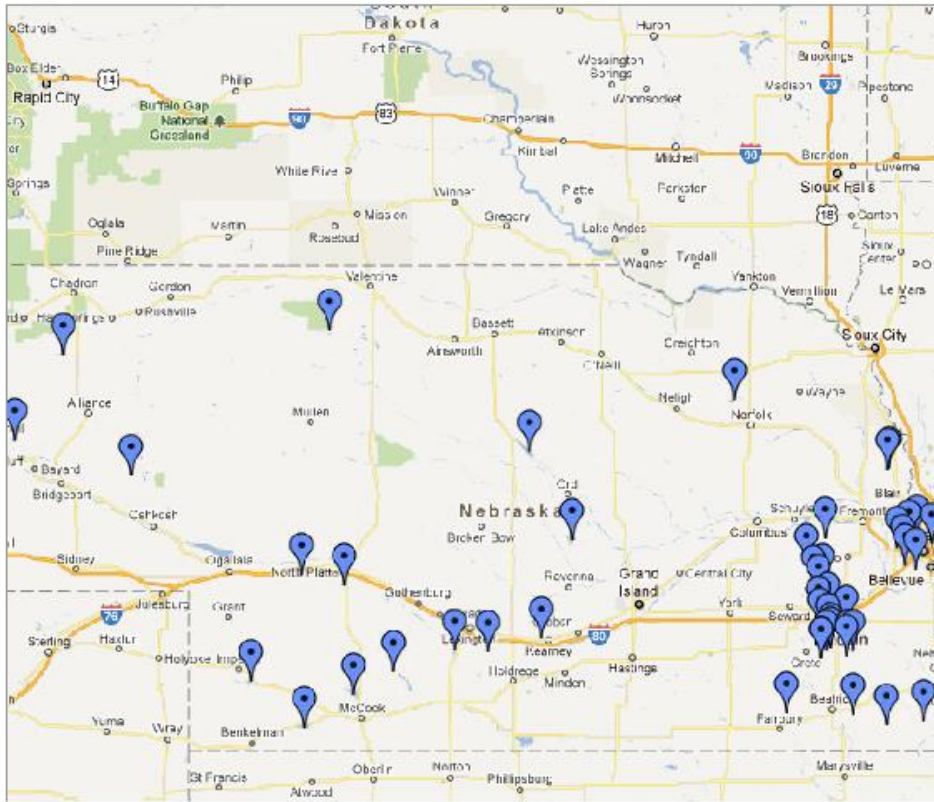
Table 1: Locations of Boater Surveys, Outreach, and Watercraft Inspections