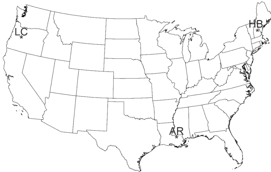
Figure 2 Location of the watersheds employed in the study. HB: Hubbard Brook in New Hampshire; LC: Lookout Creek in Oregon, and; AR: Amite River near Denham Springs in Louisiana

from 2300 to over 3550 mm at higher elevations. In the wintertime, rain is mixed with snow in the lower portion of Lookout Basin and snow is more persistent at higher elevations (above 1000 m). The time-period with the most abundant data falls between October 1, 1998 and September 30, 2011. See www.lternet.edu for more detailed information of the two experimental catchments.