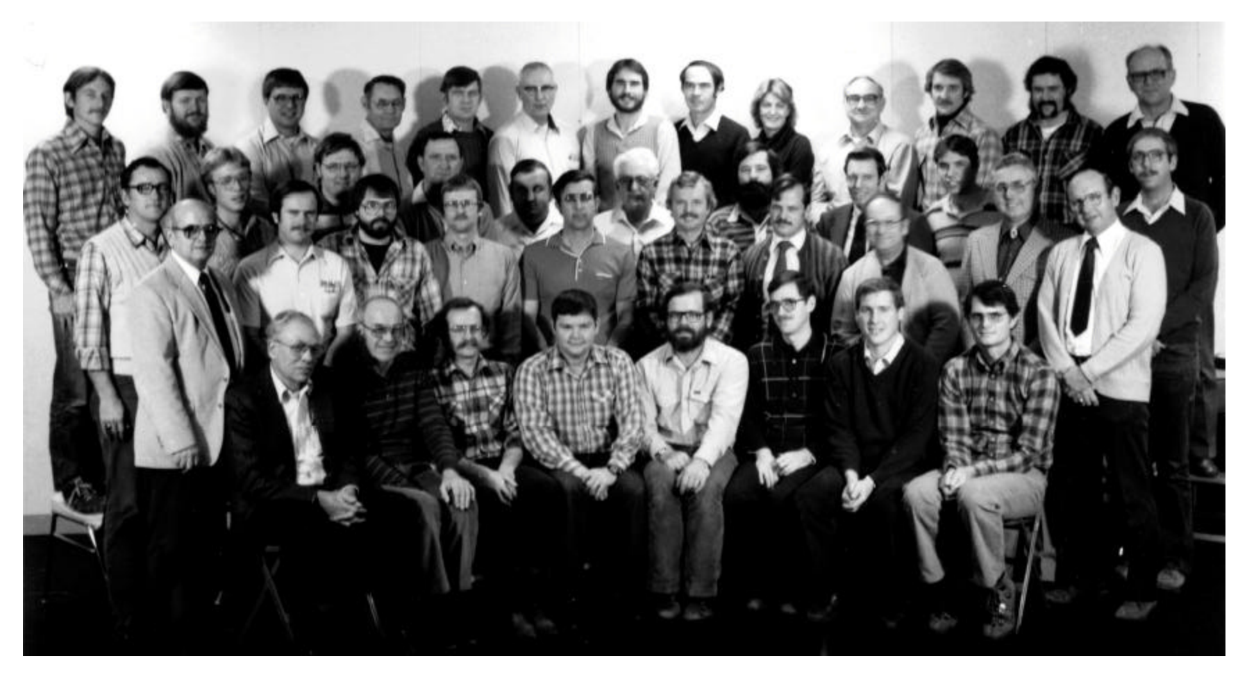
State meeting of Soil Conservation Service and Conservation and Survey Division Soil Scientists in Lincoln, 1982, during the Accelerated Soil Mapping Program.