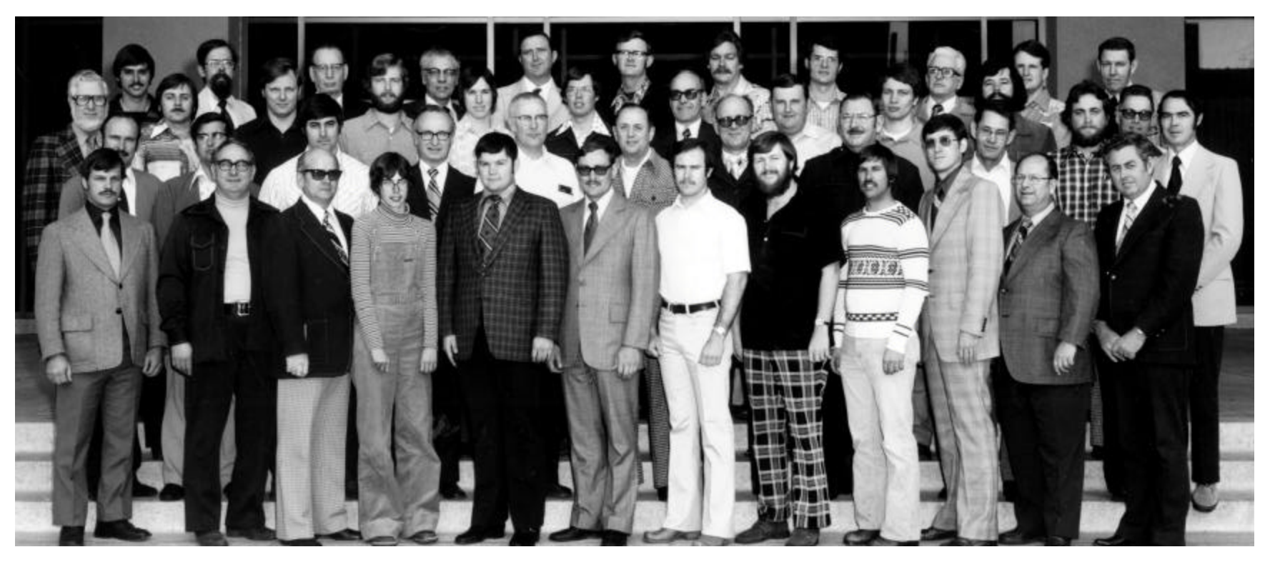
State Soils Workshop of Soil Conservation Service-USDA and Conservation and Survey Division-UNL Soil Scientists in 1976.